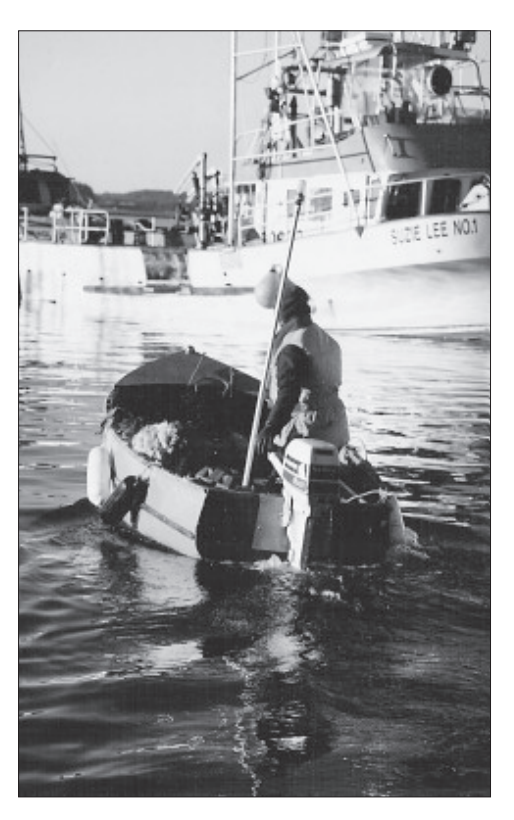
I was a nervous boater and felt very grateful for the strength and stability of our fourteen-foot Davidson skiff.

a vaguely defined plot of land. We kept our tiny apartment in Rupert and played house at Salt Lakes, spending romantic candlelit evenings at the cabin, then going back to our real life in town. We imagined settling down in this slipshod paradise, but as it turned out, I ended up living there alone.