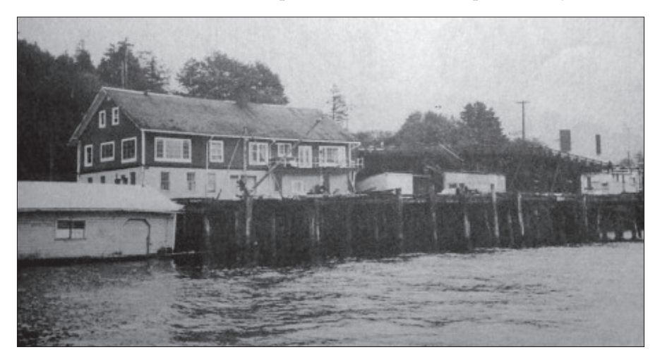
Function Junction was a gathering place, and often a refuge in a storm, for folks coming to town from across the harbour and beyond.

I got my first glimpse of north coast nautical life in 1977 at Function Junction, on the Prince Rupert waterfront—a dilapidated tugboat base