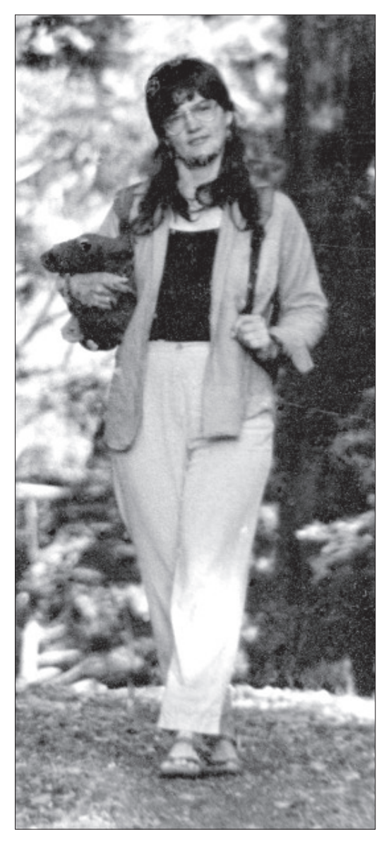
When I came north in the late seventies, I had no idea how soon, and how drastically, my life would change.