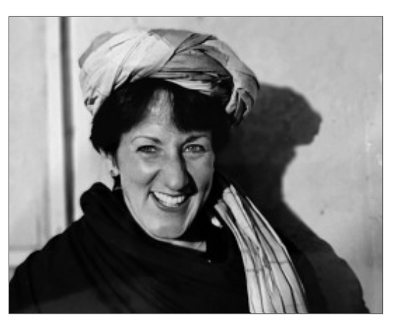
In Afghanistan, a land so different from Canada, how would I fit in?

Intrigue and adventure finally won. I could add a novel country to the list of forty-five that had already visited. Ι The following week, I signed a contract. From that point, my life moved along a conveyor belt as I acquired vaccines and visas, packed my belongings into a storage locker and said goodbye to friends in a whirlwind of events. In the end the decision to go had been quite simple.