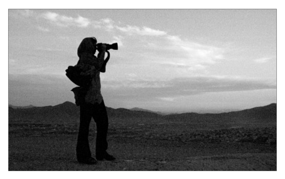
Travelling the world as a doctor, camera in hand, I wanted to understand everyone I met.

Gosh, the job sounded dreadful. Why give up nine months of your life to live like a prisoner? And how on earth would she meet these persecuted women?